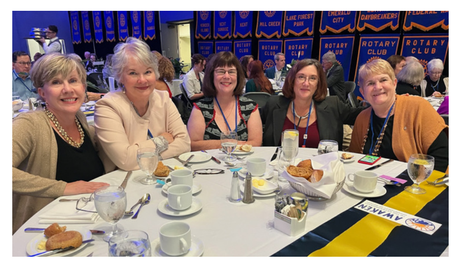
Saturday night dinner